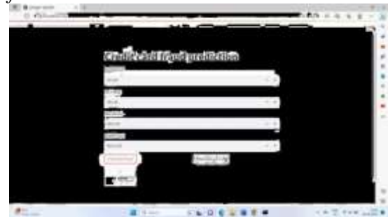
Figure 3: Output Screen of Detected as not the fraud transaction