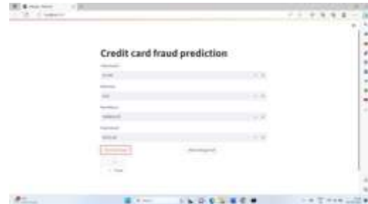
Figure 2: Output Screen of Detected as the fraud transaction